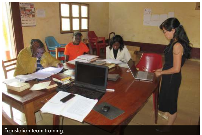
Translation team training.